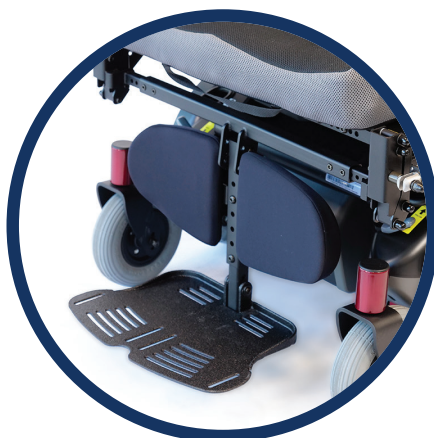
Discontinued VHD version