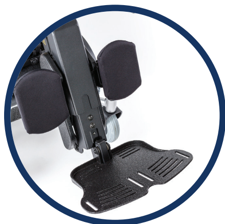
Discontinued STD & HD versions